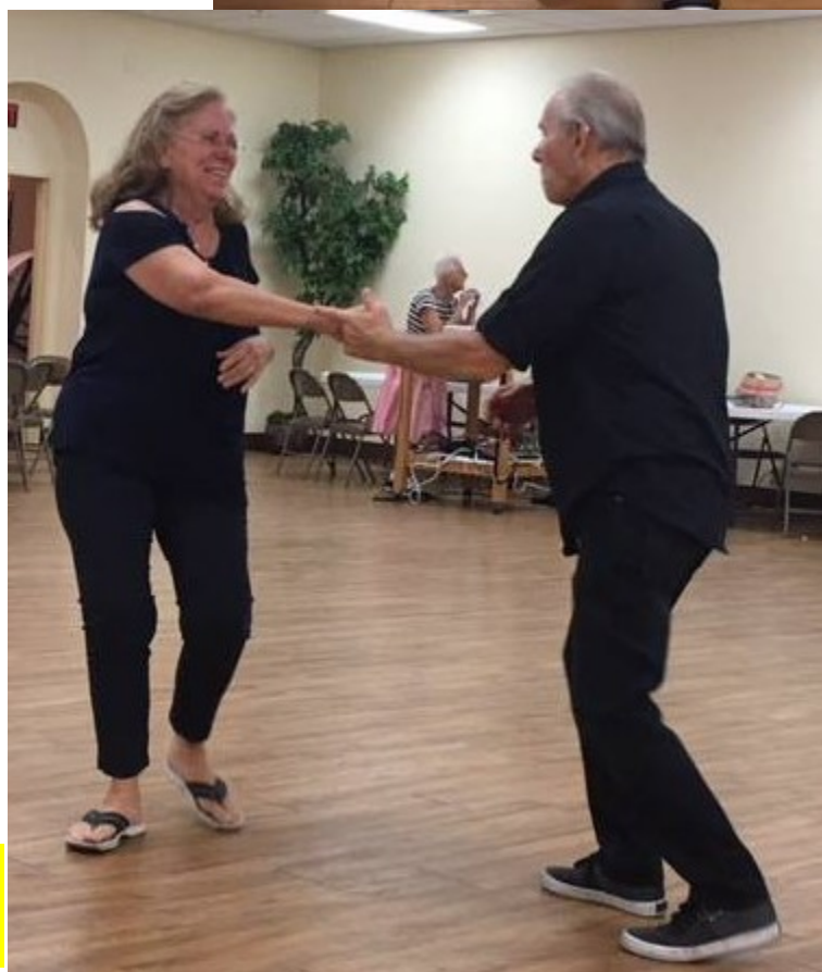
Rock-N-Roll Sock Hop