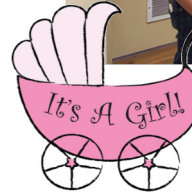
Smock Baby Reveal October 13, 2019