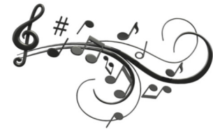
West Side Tremble Clefs October 13, 2019